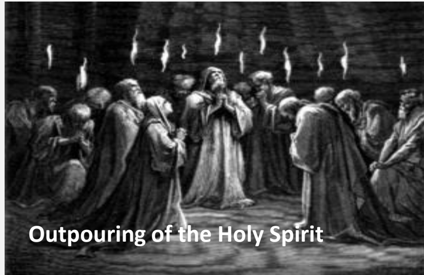
Outpouring of the Holy Spirit