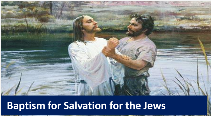
Baptism for Salvation for the Jews

Cornelius, a devout, God-fearing Roman Centurion. God sees our deeds done in love for others Ceaserea, Headquarters for the Roman forces of Occupation, named after Augustus Ceaser.