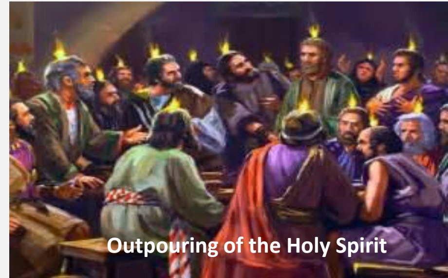
Outpouring of the Holy Spirit