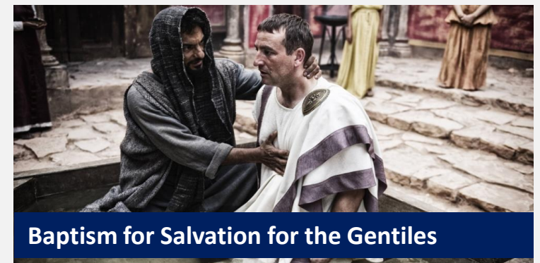
Baptism for Salvation for the Gentiles

Acts 11:18 ‘ So then, God has granted even the Gentiles repentance unto life’